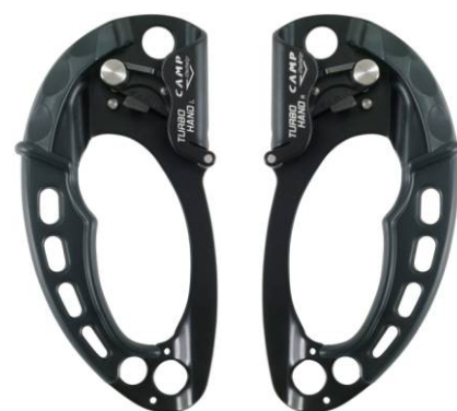
263401-L8 Black Left