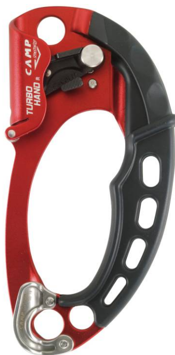
Turbohand Right - Ref. 2634-R1 + Turbohand Guide Right - Ref. 0966 R