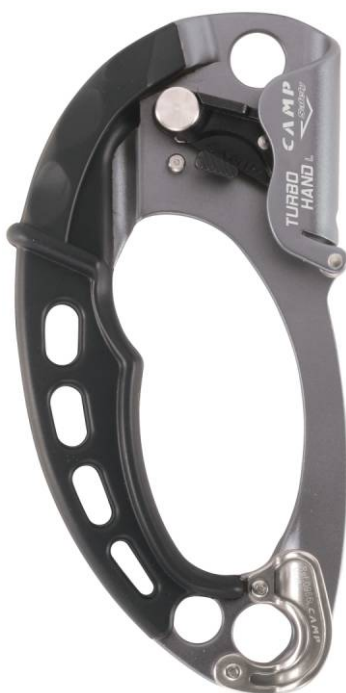
Turbohand Left - Ref. 2634-L2 + Turbohand Guide Left - Ref. 0966 L